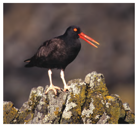
Black oystercatchers nest on islands in Glacier Bay National Park

+ Multi-day trips allow for the richest experience.