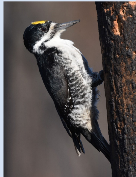
Alaska Black-backed Woodpecker.

The Black-backed Woodpecker is a seldom-seen bird of the North American boreal forests and montane forests in the western United States. Its core range in Alaska is largely within the range of white spruce in the Central and Southcentral bioregions, but it has been observed in most of the state's forested regions, and individuals have strayed as far as Kodiak and St. Paul islands. It feeds by excavating larval bark- and wood-boring beetles from dead or dying coniferous tree trunks, and it often nests in decaying trees in stands with high snag densities. Because of its reliance on dead and dying trees, it frequents recently burned areas and can colonize forests within weeks of a wildfire. Little is known about its population trends in Alaska. Fire suppression and postfire salvage logging can potentially affect these birds on a local scale. Spruce beetle outbreaks can provide additional feeding opportunities, and evidence from another species in this genus indicates that woodpecker predation on spruce beetles may have a stabilizing role on the dynamics of beetle outbreaks, which can cause widespread tree die-offs.