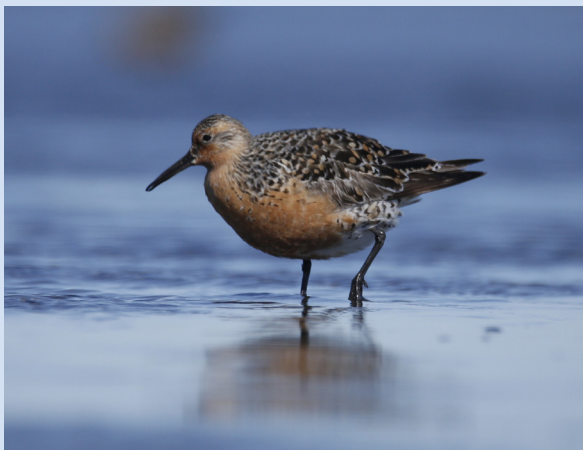
Pacific Red Knot.

offer comments on pending proposals or legislation affecting wildlife in the state. For example, ADF&G engages with federal partners in multiple ways regarding ESA listing decisions involving Alaska's wildlife; data and information are provided to federal partners so that the best available science can inform decision making. The state also comments on proposed and existing ESA listings, which may include the designation of critical habitat or the delisting or downlisting of species.