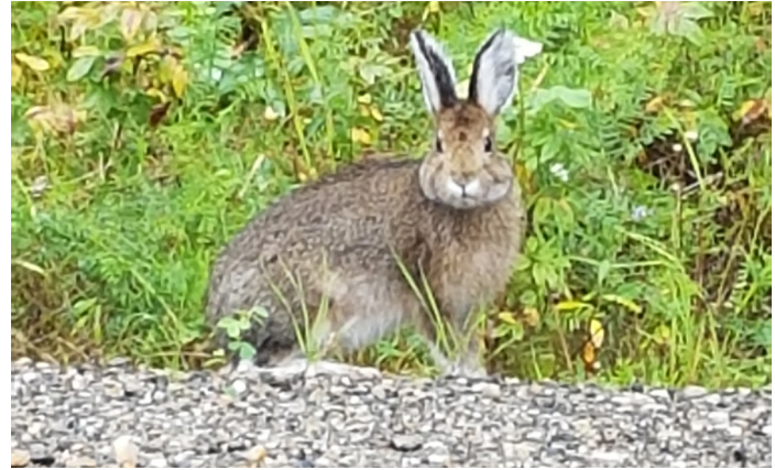
Alaska hare.

Effective and timely management of individual species is necessary to maintain sustainable population levels of SGCN in Alaska. Within the broad scope of species management actions, including SWG-funded activities, ADF&G will continue the ongoing and careful management of Alaska SGCN, including harvested species managed under the sustained yield principle for the use and enjoyment of future generations.