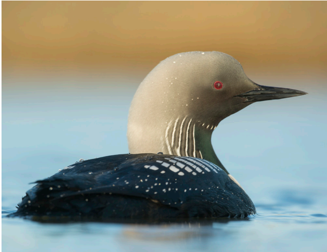
Pacific Loon.

provided insights into this bat's seasonal ecology and habitat use. In addition, most of the known bat maternity colonies in the state were first identified and reported by citizen scientists. Since the summer of 2014, citizen scientists have been helping conduct acoustic driving surveys for bats (ADF&G 2024f). These data will be contributed to the North American Bat Monitoring Program to help develop estimates of population trends at both regional and continental scales.