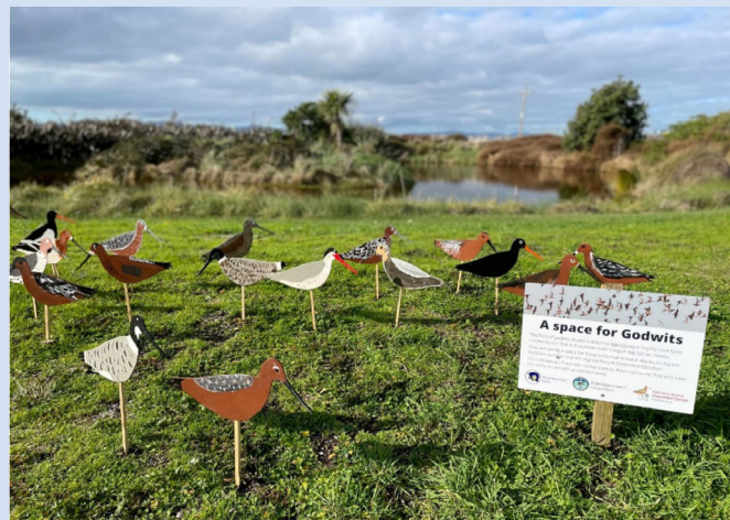
On the Yukon-Kuskokwim Delta, students and teachers in Hooper Bay sent this shorebird flock to the Pukorokoro Shorebird Centre in New Zealand. The Bar-tailed Godwit breeds on the Yukon-Kuskokwim Delta and North Slope in Alaska and winters in New Zealand and Australia.

Shorebirds migrate across continents and oceans, relying on key areas to rest, eat, and refuel. Alaska hosts about one-third of all shorebirds on Earth. Within Alaska, the Yukon-Kuskokwim Delta provides important habitat for millions of shorebirds. This delta is also within the homeland of the Indigenous Yup'ik people, who rely on shorebirds for food and cultural resources. Shorebirds are harvested in relatively small numbers in Alaska, but this harvest now includes SGCN, such as the Bar-tailed Godwit ( tevatevaaq and teguteguaq in the Yup'ik language). The objectives of the Yukon-Kuskokwim learning and outreach program are to support awareness of and stewardship about shorebird ecology and conservation, transmission of Indigenous knowledge and Yup'ik language, and interest in learning and nature. In collaboration with schools, communities, and other partners, the shorebird outreach program reached 18 communities, 88 local educators, and 3,179 students in 2022–2024. Community meetings, management meetings, and local presentations addressed other audiences. Shorebirds provide engaging contexts for learning about healthy habitats, food chains, geography, and the diverse peoples across shorebirds' migratory routes.