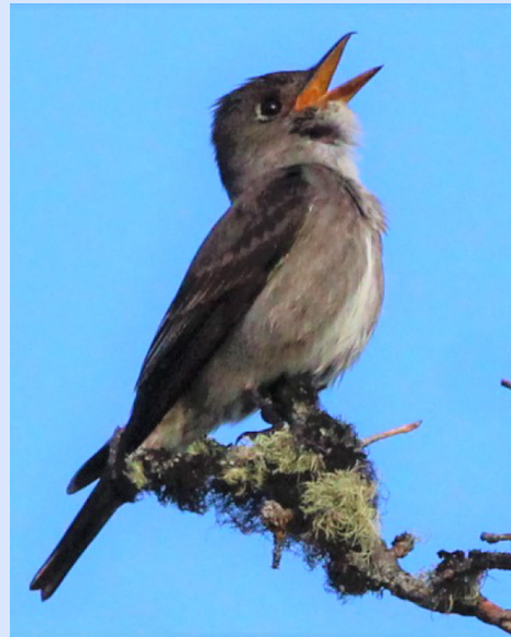
Olive-sided Flycatcher.

The Olive-sided Flycatcher, a long-distance migratory songbird, is a distinctive inhabitant of Alaska's boreal forests. True to its name, this bird primarily feeds on aerial insects and aligns its peak nesting season with the abundance of insects in Alaska's moist and buggy boreal forests. It is estimated that the population of Olive-sided Flycatchers has declined by almost 80% across North America in the past 40 years. Much of this decline is attributed to adult mortality during their extensive migration—one of the longest of any North American songbird. Adults travel between 12,000 and 17,000 miles annually, migrating south through Mexico and Central America to winter in South America, reaching as far as Bolivia and the Andes Mountains. Satellite tracking studies done by ADF&G biologists have identified crucial stopover sites along their migration route, and these data are also being used by partners in efforts to help halt the decline of this species. One of the Olive-sided Flycatcher's identifying behaviors is "tree topping" or perching on the highest point of a coniferous tree or dead snag from which it flies to and fro, capturing insect foods in the air column. More often heard than seen, its distinctive call of "Quick! Three beers!" is a sound many Alaskans look forward to hearing during summer.