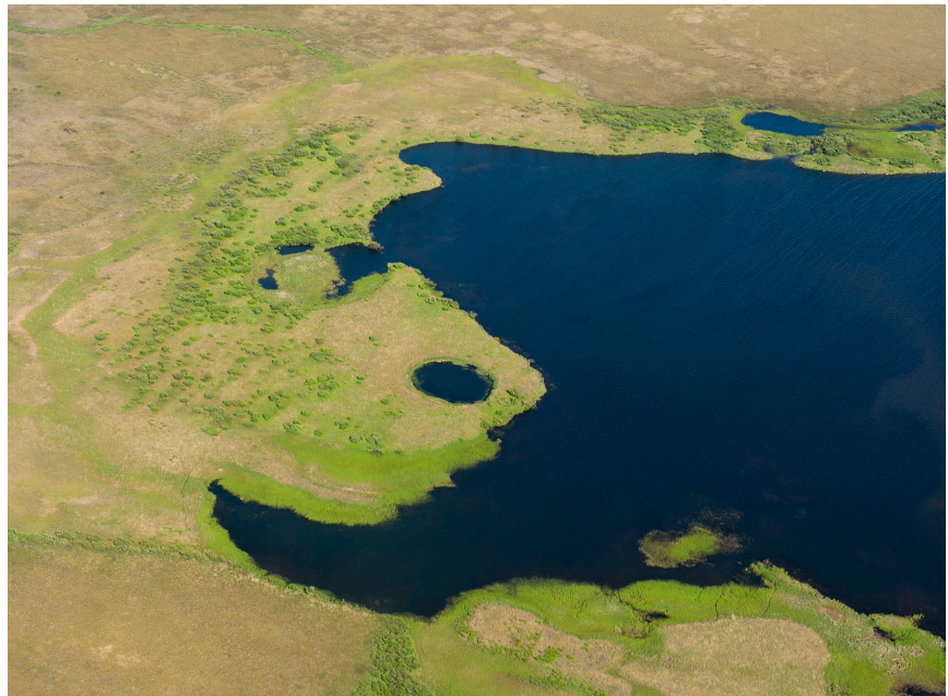
Wetlands along the Kobuk River.

State and federal lands account for about 88% of all the land in Alaska. A substantial proportion of these lands—and, by extension, much of Alaska’s landscape—is already designated for conservation, whether as park land (managed and preserved unimpaired lands for public use), wildlife refuge