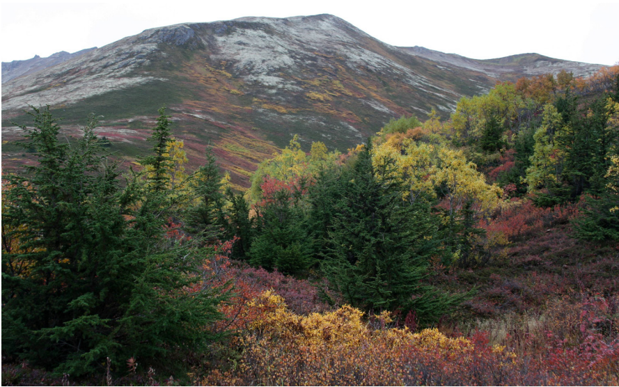
The transition zone where tree growth stops and alpine vegetation begins.

ADF&G published principles and guidelines for state forest areas in Central Alaska that aimed to identify opportunities and actions mutually beneficial to both timber and wildlife management (Paragi et al. 2020). The recommendations were incorporated into the Alaska State Forest Action Plan developed by the DNR Division of Forestry and Fire Protection (DOF; DOF 2020: 67–68). The overriding goal of these guidelines is to assist wildlife and forest managers in collaboratively integrating their separate, but often compatible, responsibilities for managing resources. The report describes best management practices for SGCN that can enhance forest regeneration and make