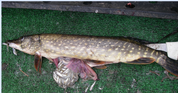
Salmonids in northern pike stomach.

Northern pike have a generalist diet but prey heavily on other fish when available. They thrive in areas with dense aquatic vegetation, which is necessary for egg adhesion during spawning, camouflage as juveniles, and ambush predation as adults. Northern pike do not frequent deep littoral zones of lakes or turbid, high-velocity rivers. Habitat