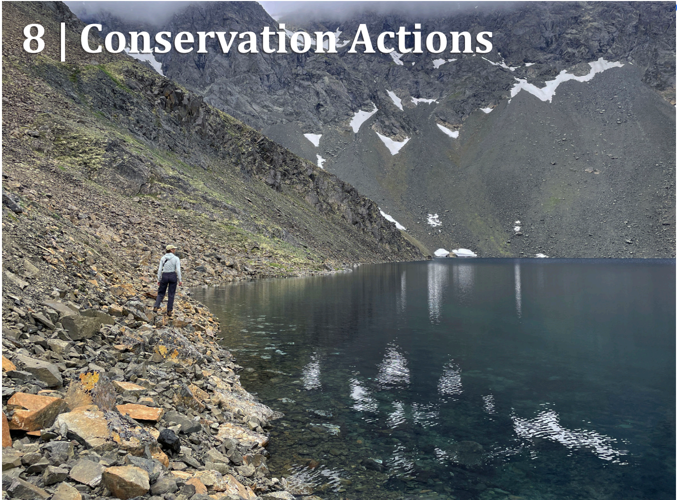
A researcher surveys for collared pikas in Snowhawk Valley.

Conservation actions are activities conducted to improve the status and understanding of “species of greatest conservation need” (SGCN) in Alaska, reduce the need for future listings under the Endangered Species Act (ESA), and fulfill Alaska Department of Fish and Game’s (ADF&G’s) mission and mandate under the Alaska Constitution to manage fish and wildlife species according to the sustained yield principle (Alaska Constitution, Art. VIII, § 4). Conservation actions can take many forms, including filling critical information gaps on population status and trends; understanding habitat use during breeding, migration, and nonbreeding seasons; managing broad-scale threats to support species’ resilience; and monitoring population recovery. Priority conservation actions include identifying drivers of decline, promoting partnerships, and implementing effective and achievable projects to ensure sustained yield.