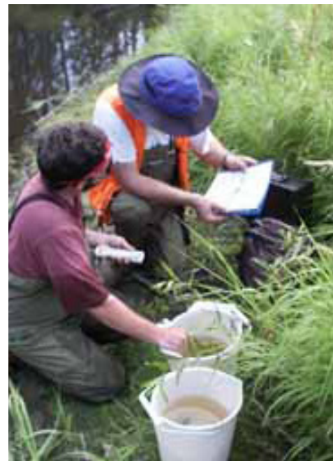
Researchers evaluate stream water quality.

Marine biodiversity is correlated with structural habitat diversity. Areas of the seafloor that are characterized by boulders, corals, and other living organisms are susceptible to damage from fishing gear, particularly bottom trawls. Regulations prohibiting groundfish bottom trawling and scallop dredging have been implemented to conserve and manage areas where this habitat type is known to occur. These locations comprise a relatively large portion of the continental shelf and, in many respects, serve as marine conservation areas.