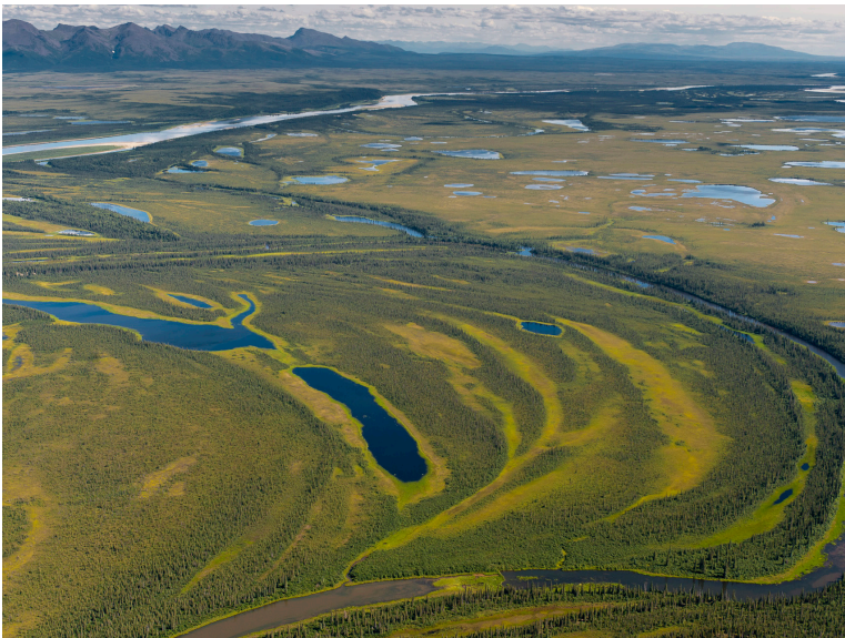
Oxbow lakes along the Kobuk River.

A specific priority for building capacity is engaging with species working groups, as noted above, and the Pacific Flyway Council Study and Nongame Technical Committees. These groups help support conservation and management actions for populations of Alaska’s wildlife at migratory staging and wintering areas across state and national boundaries, where threats to species that breed in Alaska are often high. Other priority areas for building capacity include collaborative activities to promote stream and wetland restoration efforts, as well as invasive species control and eradication.