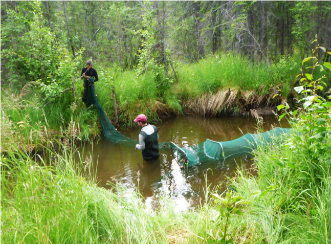
Researchers use fyke nets to capture fish for identification purposes.

resource extraction that occurs in such waters. Additional management is also accomplished by the National Marine Fisheries Service (NMFS), which designates essential fish habitat (EFH) under the Magnuson–Stevens Fishery Conservation and Management Act. ADF&G maintains and continually updates the Catalog of Anadromous Waters (ADF&G 2024b) that identifies where permitting of anadromous waters is required. These cataloged waters represent most of the state’s large rivers and streams and a growing number of smaller streams. As of October 2024, there were 19,247 streams, including mainstem reaches and tributaries, listed as supporting anadromous