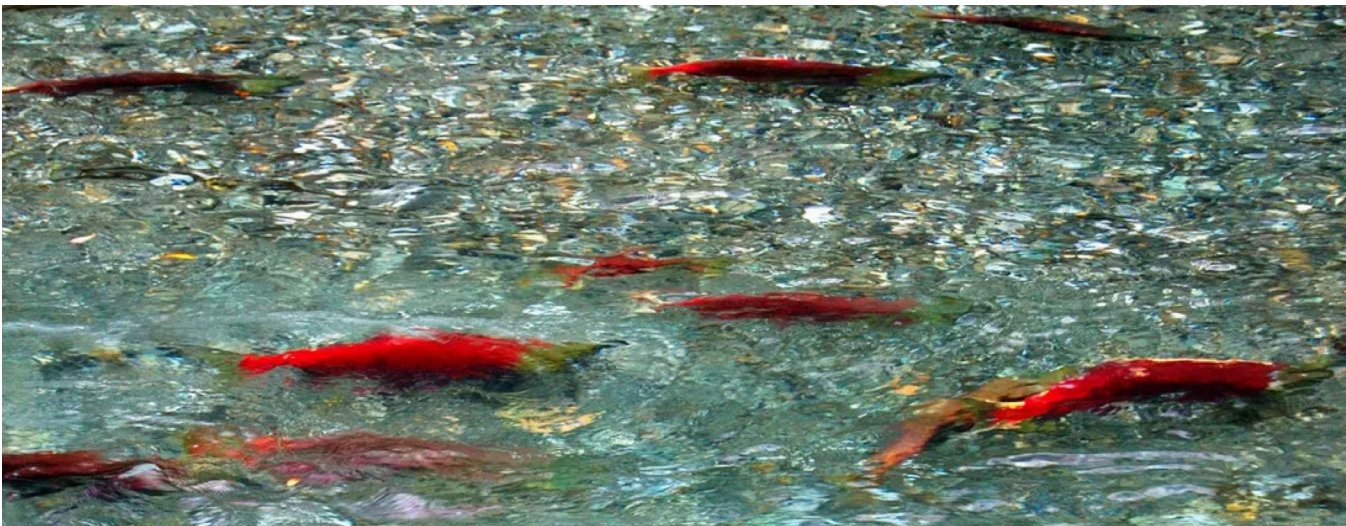
Sockeye salmon in Dry Bay, Glacier Bay National Preserve, Alaska.