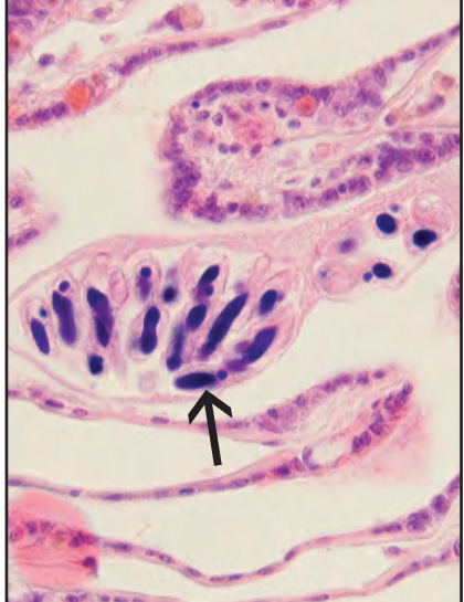
Xenoma of gill epithelial cell in blue mussel formed by Sphenophrya sp. (arrow)