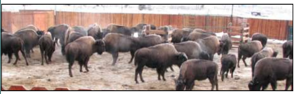
Bison in corral before being separated into smaller groups in the wooden chutes

EINP have TB or brucellosis (see the winter 2008-2009 issue of the Wood Bison News ). The wood bison selected for possible import to Alaska were individually tested for TB, brucellosis and a variety of other diseases. Finally, based on the USDA risk assessment and negative disease test results the bison were cleared for import to Alaska by the Canadian Food Inspection Agency, the USDA, and