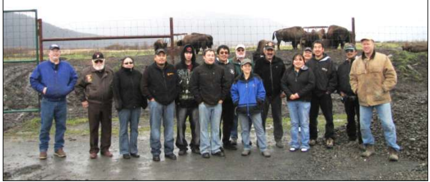
People from the lower Yukon/Innoko communities and friends visited the wood bison at AWCC in October 2009.

Another important factor involved in the decision