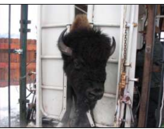
Bison is held safely in the hydraulic squeeze chute while veterinarian injects deworming treatment.

During each of the handlings a few adult bison refused to enter the chutes and had to be anesthetized so that the necessary samples could be obtained. During the March 2009 handling a large bull refused to enter the chute system and charged one of the handlers in the corral. Fortunately, he was not seriously injured. Because of this incident the handling procedures were modified to improve animal and personnel safety. For the most recent handling last February the five largest bulls were separated from the herd and anesthetized so they did not have to be moved through the handling facility. Even then, there were two other bison that would not enter the chutes and were anesthetized so their testing could be accomplished.