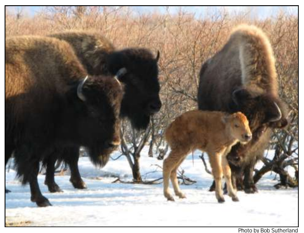
A newborn calf at AWCC with mother and curious on lookers. Cows are very attentive and protective of their newborns.

with bison experts in both Canada and the United States to ensure the bison are getting the best care possible. We continue to learn about wood bison. For example, because bison will lose weight during winter no matter how much they are fed, AWCC focuses on providing rich summer pasture and some grain supplements so the animals have adequate fat reserves in the fall and to help assure successful breeding and healthy calves each spring.