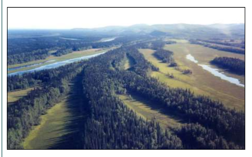
Extensive meadow systems mixed with forest along the Innoko River can provide high quality wood bison habitat.

ess for each site where wood bison restoration is pursued. These planning efforts will involve all stakeholders including local and non-local residents, conservation groups including sports men's, environmental and Native organizations, resource development interests and affected state and federal agencies. Through these plan-