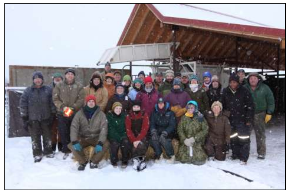
A good crew is essential to a successful handling. Participants have included people from AWCC, ADF&G, the Office of the Alaska State Veterinarian, University of Alaska, U.S. Fish and Wildlife Service, USDA, and the Bureau of Land Management.

already have an ear tag, numbered ear tags are attached for permanent identification. The veterinarians and their assistants take samples of blood and feces to be tested for diseases, and samples of blood and hair for genetic testing. Veterinarians evaluate the general health of each animal, review the herd health management plan, administer any treatment necessary