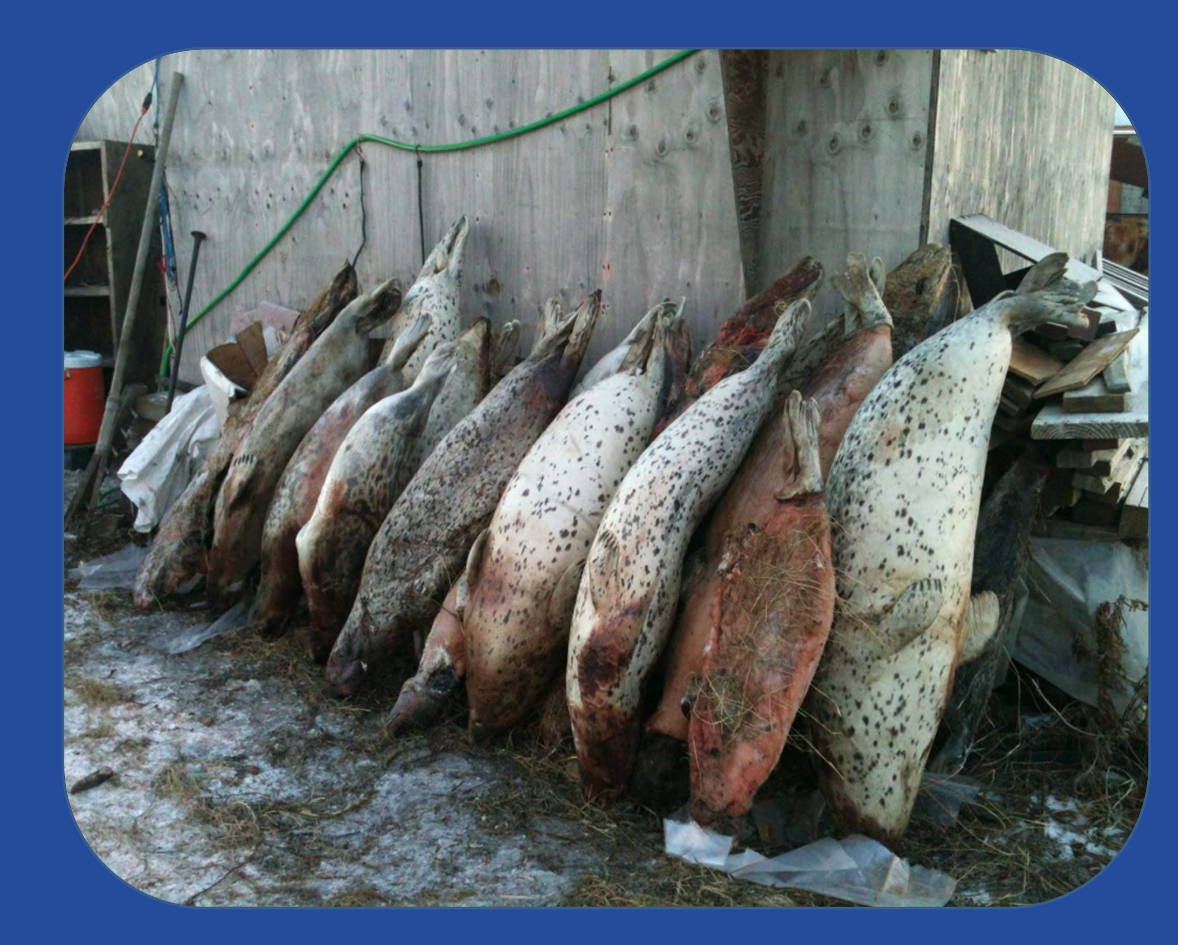
Subsistence harvested ice seals in Teller, AK.

DEMASTER, D. P. 1978. Calculation of the average age of sexual maturity in marine mammals. Journal of Fisheries Research Board Canada 35: 912–915.