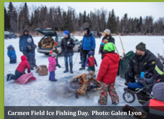
Carmen Field Ice Fishing Day.

children ages one to 15 can come and enjoy a morning of fishing. The event starts at 8am and runs until noon, when the town horn sounds. Children can learn a life skill and have fun while doing it.