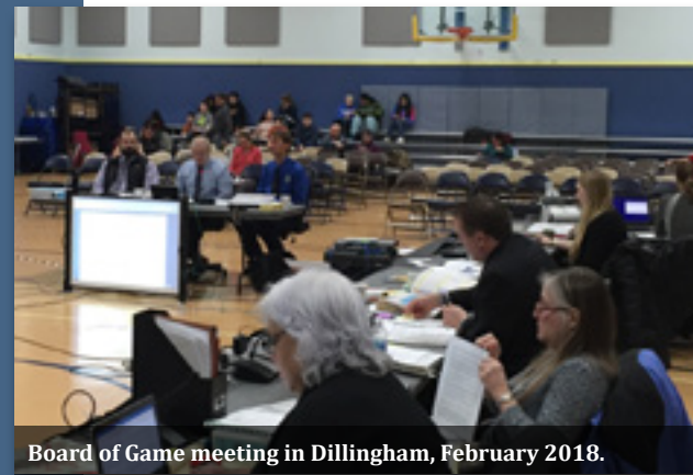
Board of Game meeting in Dillingham, February 2018.

will be considered in January 2019 at the Southeast Region Meeting. The other will provide additional antlerless and any bull hunting opportunity in Unit 16A and is scheduled for March 2019. All four proposals will be included in the proposal books this fall.