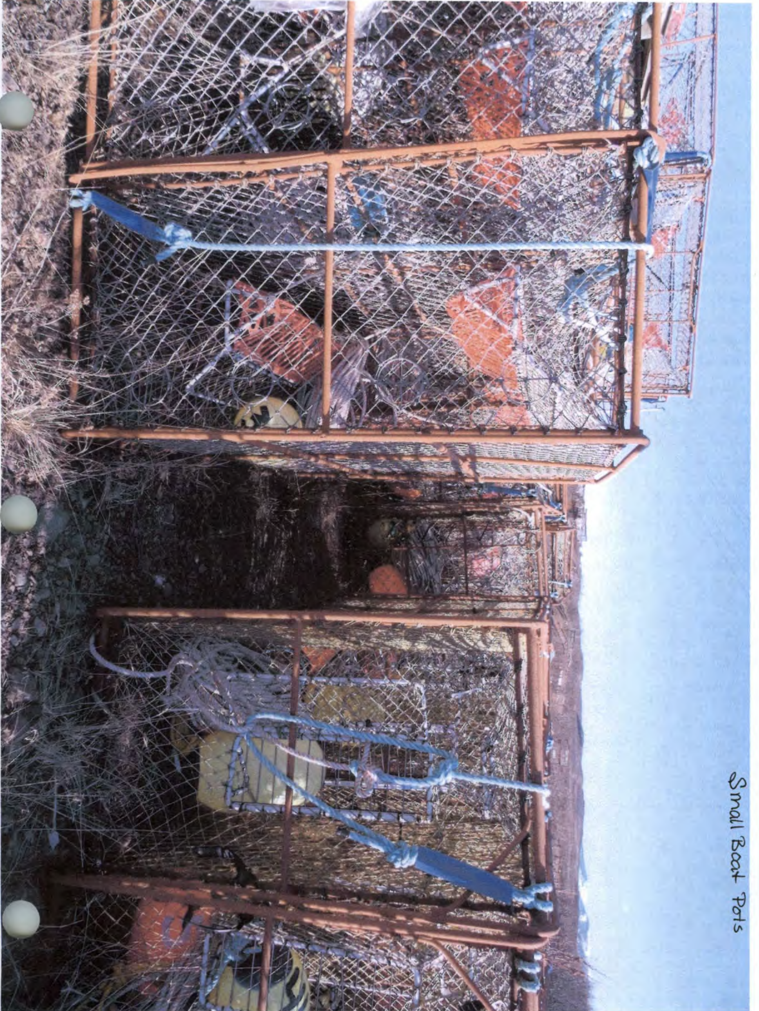
Small Boat Pets