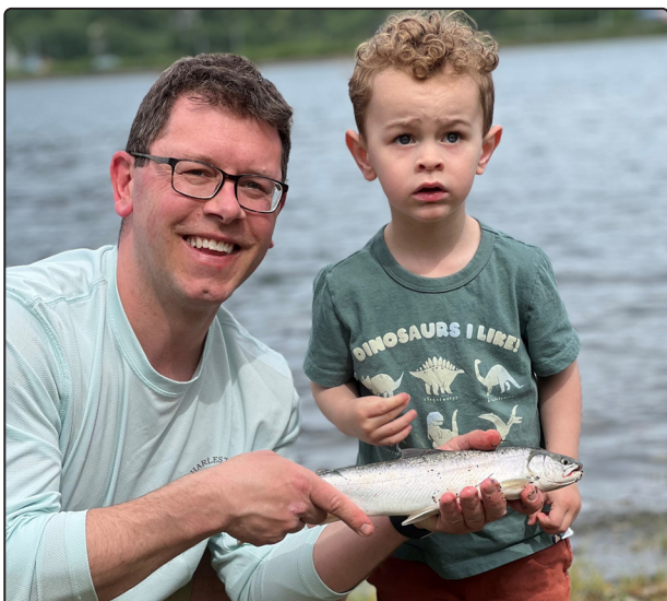
Fishing is a family tradition - start them young!