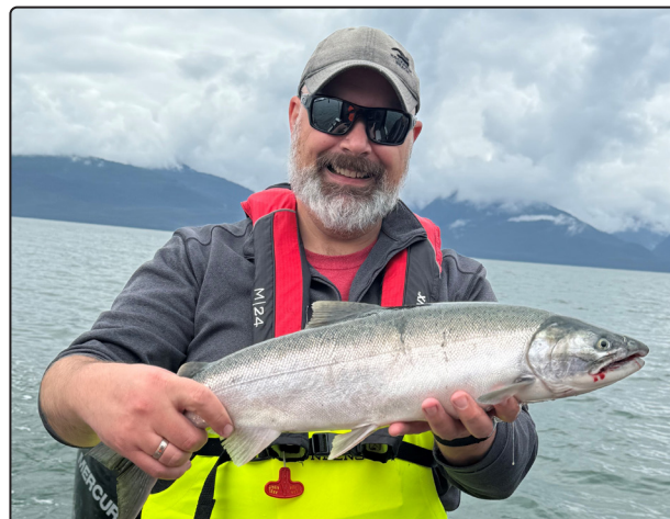
Southeast Alaska saltwater coho salmon.