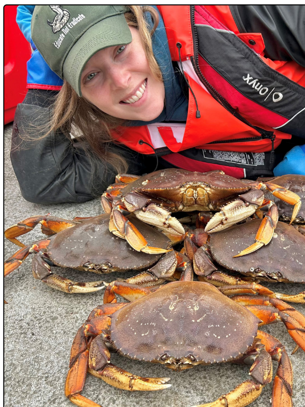
Dungeness crabs are on the dinner menu!