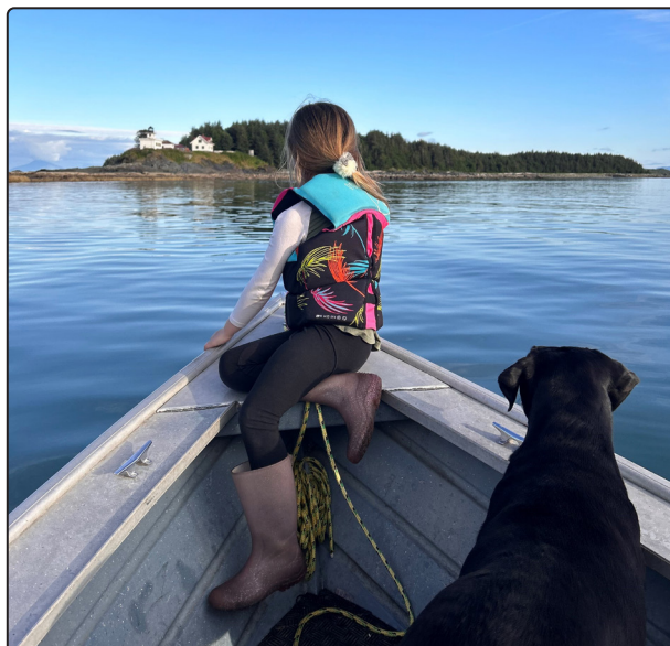
A girl and her dog, ready for a day on the water.