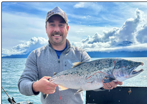
A stellar coho salmon.