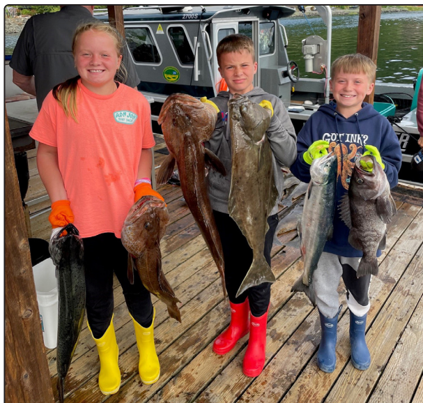
A successful day for these young anglers!