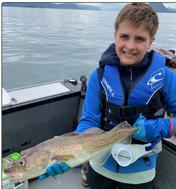
A nice Pacific cod catch!