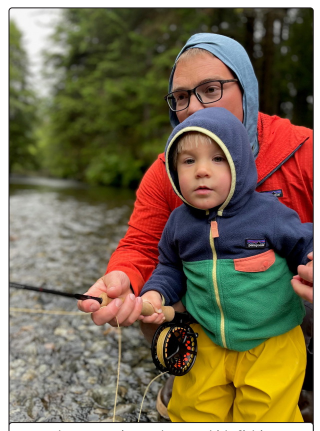
Make memories - take your kids fishing!