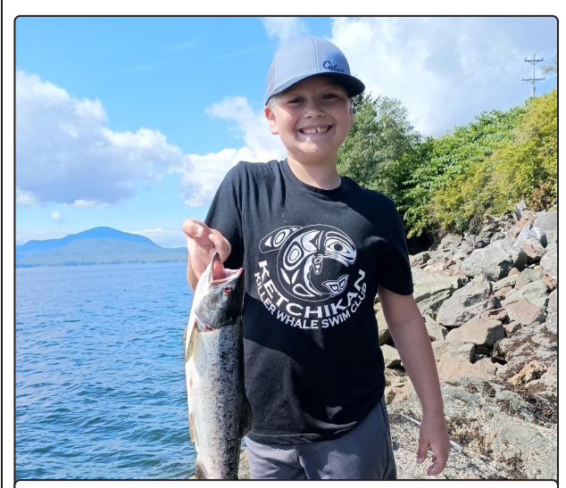
A bright pink salmon catch for this angler!