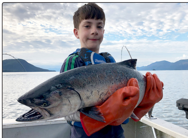
Chinook salmon from Stephens Passage.