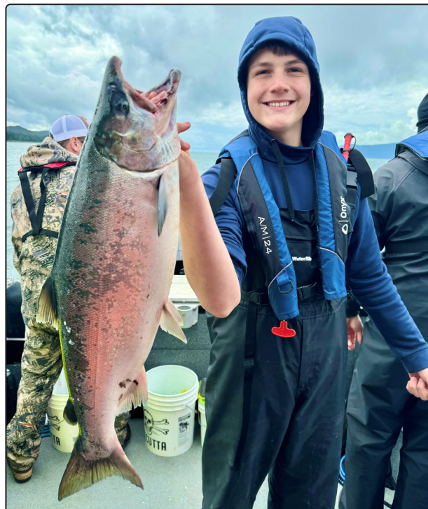
Chunky coho salmon from Juneau's saltwaters.