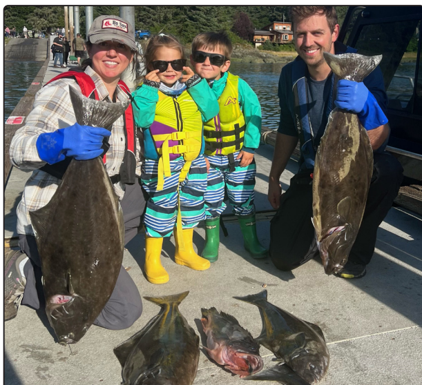
These anglers found success at Amalga Harbor.

- all salt waters adjacent to the Juneau City and Borough Road system to a line ¼ mile offshore: