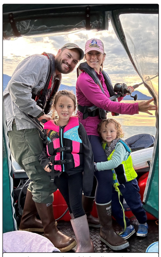
Creating memories with family on the water!