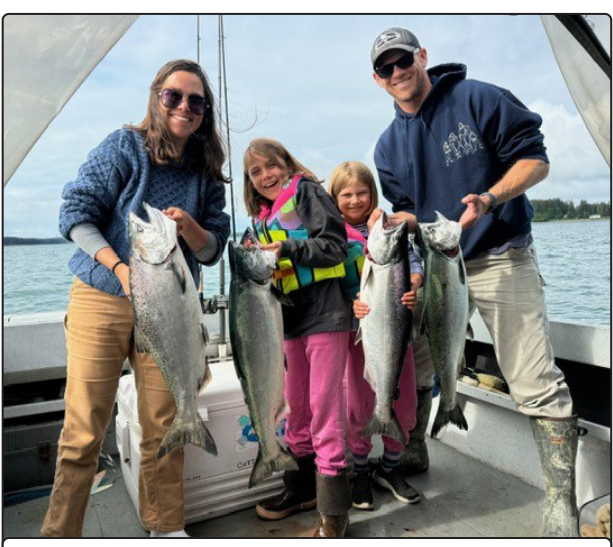
Successful day - king salmon for everyone.