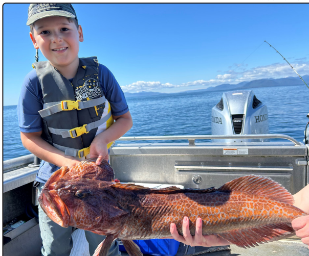
Lingcod from Nichols Passage near Ketchikan.