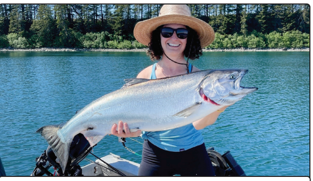
Chinook salmon caught in Yakutat Bay.

• Coho salmon: 2 per day, 2 in possession, 16 inches or longer.