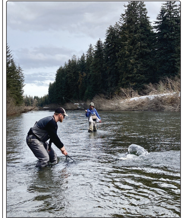
A float spinning rod setup for the win.