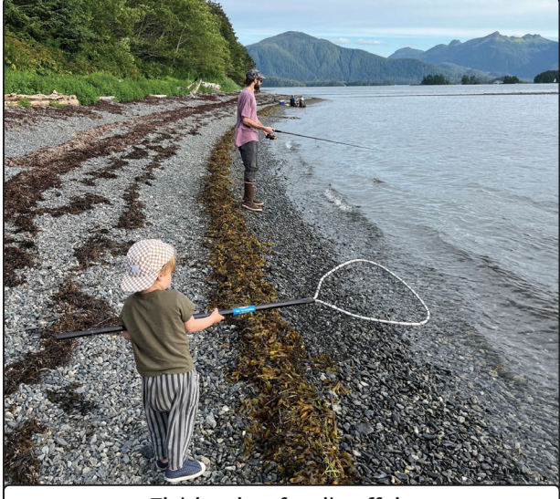
Fishing is a family affair.