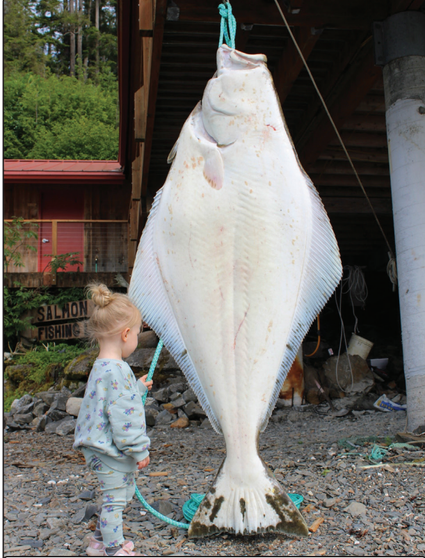
Toddler for size comparison.