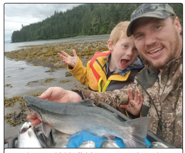
Take your kiddo fishing at Excursion Inlet.