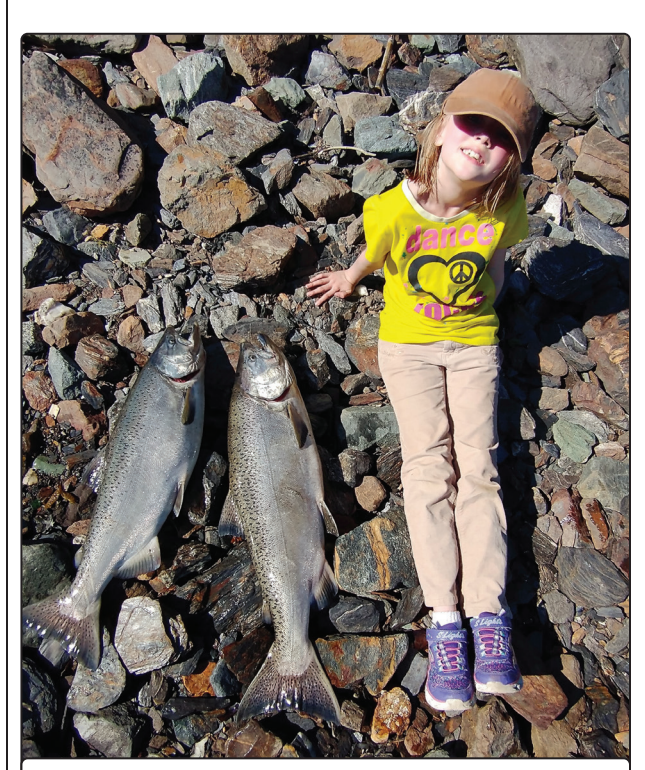
Limits obtained from Snowslide Creek.

· 6 per day, 6 in possession, 16 inches or longer.