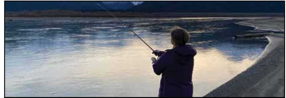
Fishing for coho salmon on the Chilkat River.