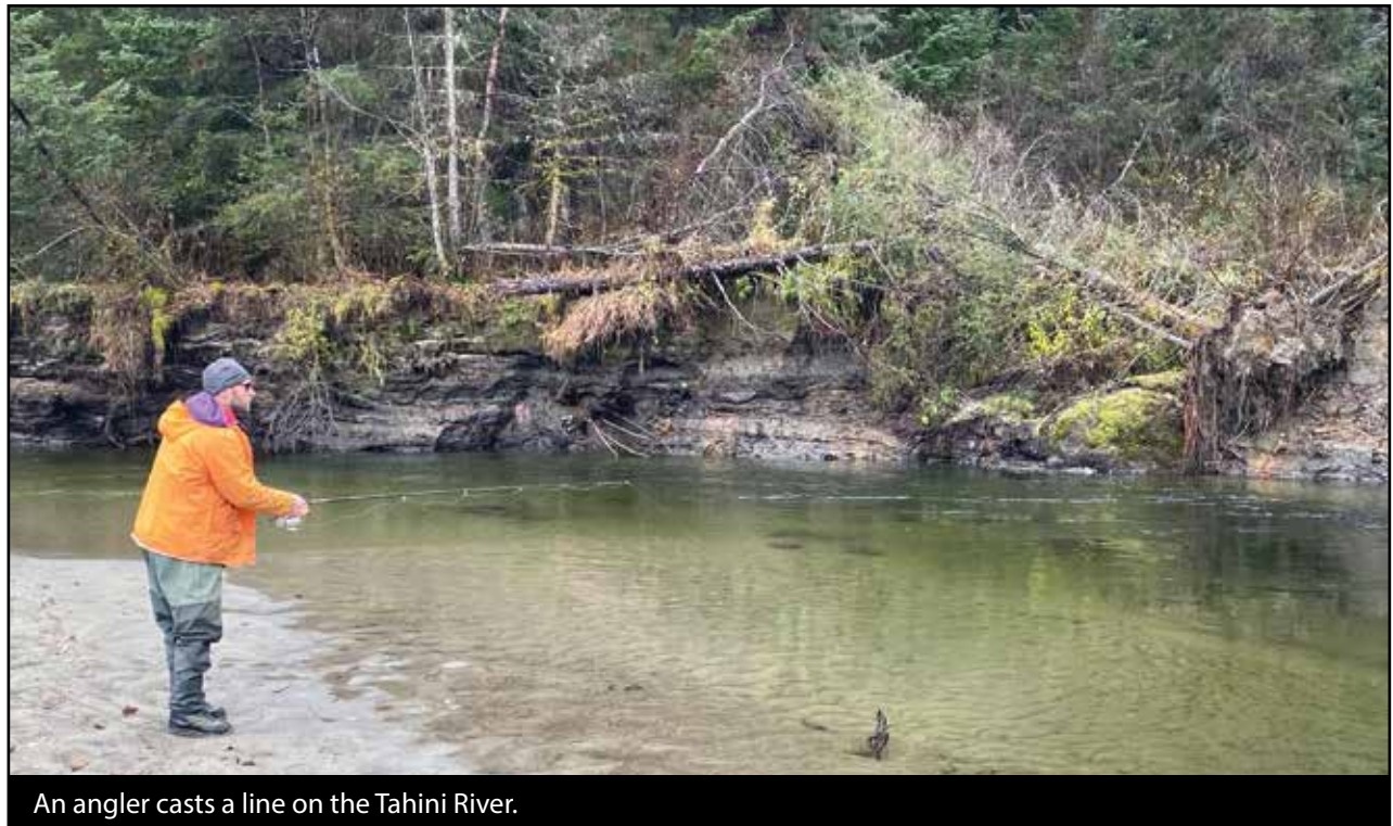
An angler casts a line on the Tahini River.

Get the latest fishing info emailed to you.