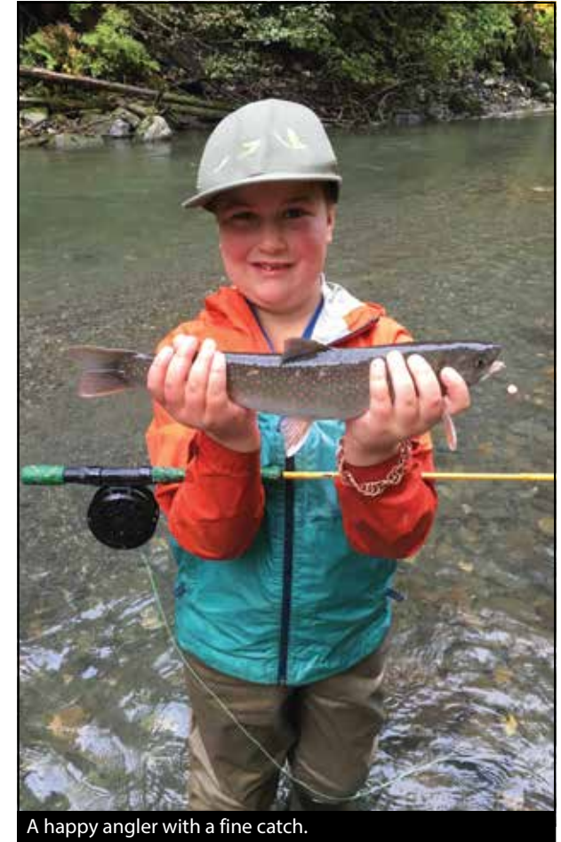
A happy angler with a fine catch.