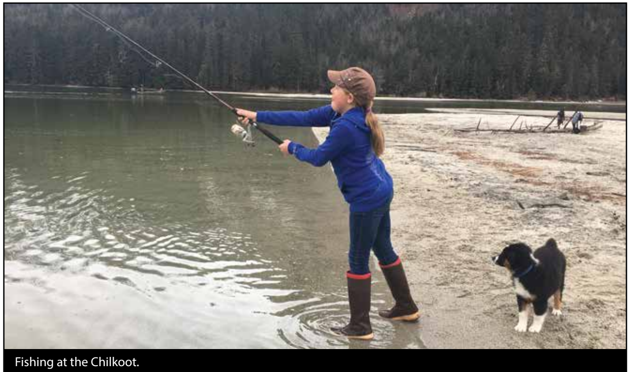
Fishing at the Chilkoot.

Get the latest fishing info emailed to you.