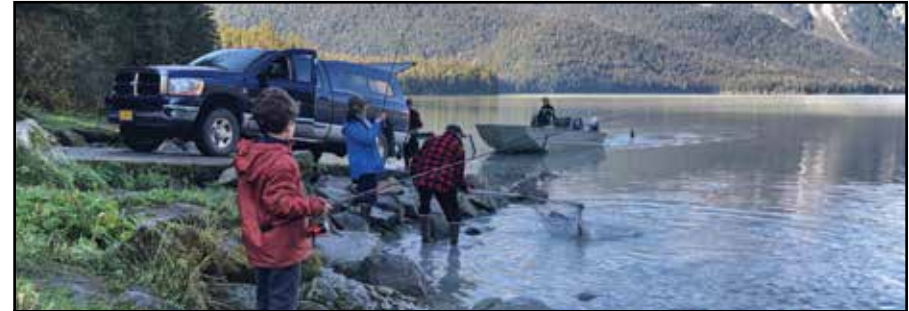
Anglers at the Chilkoot River.