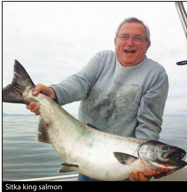
Sitka king salmon