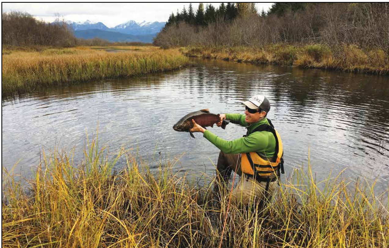
October coho salmon fishing on the Chilkat River