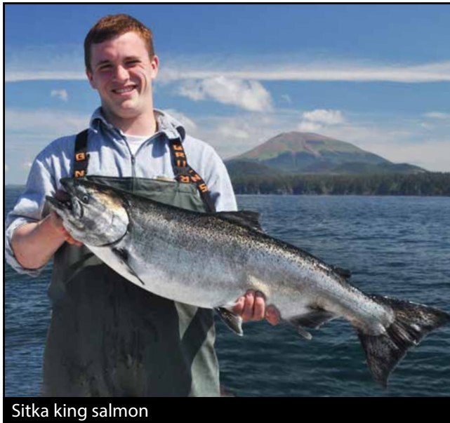
Sitka king salmon