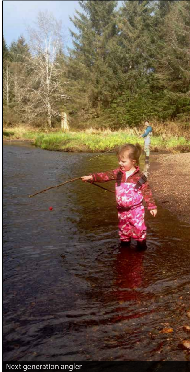
Next generation angler