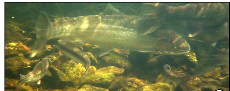
Steelhead and Rainbow Trout