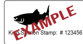
Online king stamp