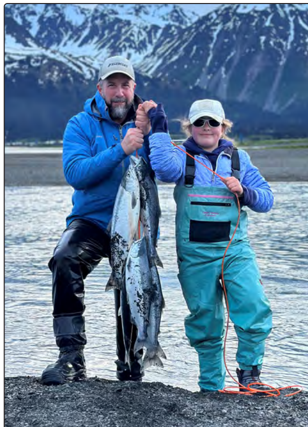
Father-daughter duo reeling in success!