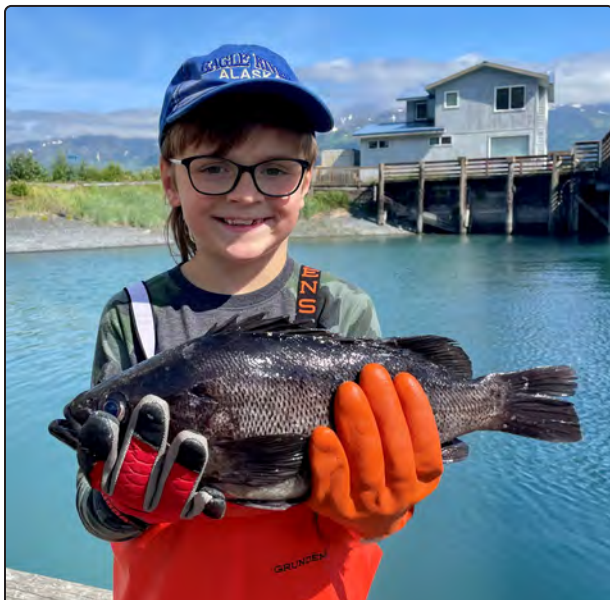
Great catch of the day.