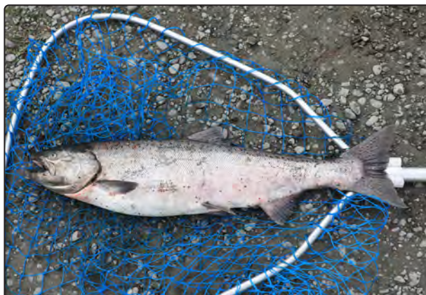
Urban fishing at its best.