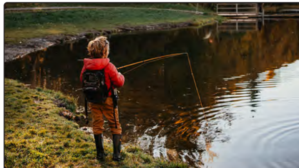
Lake fishing at its finest.