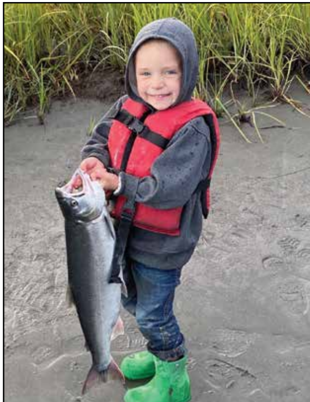
A nice coho salmon. Fishing is great family fun!