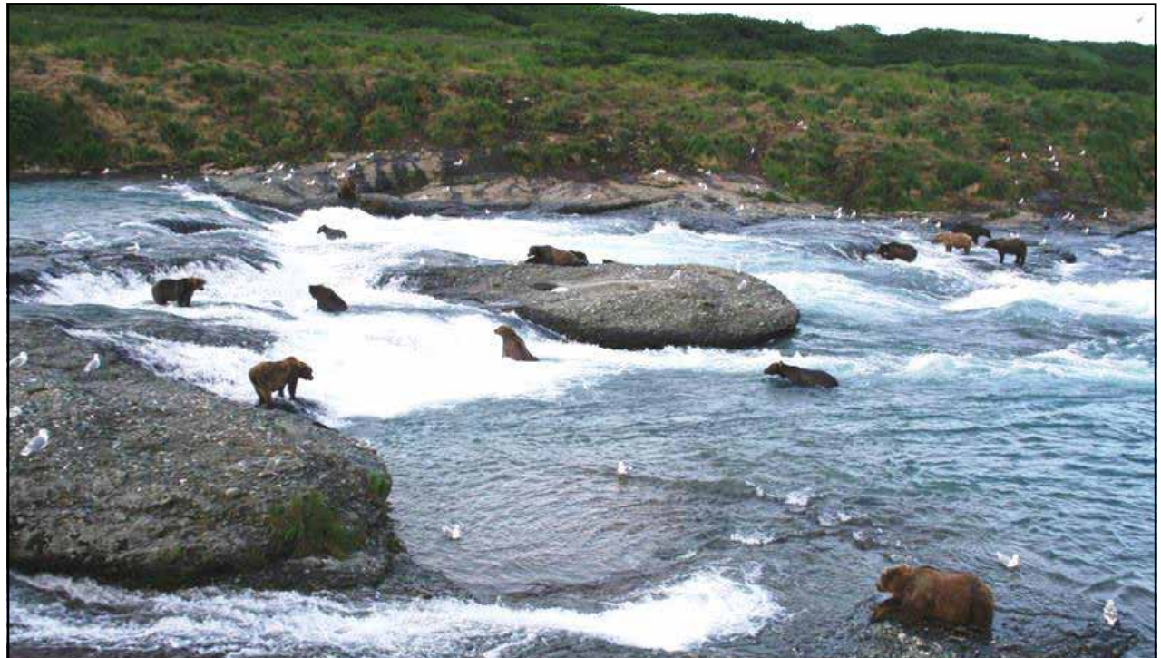
Only bears fish at McNeil River falls