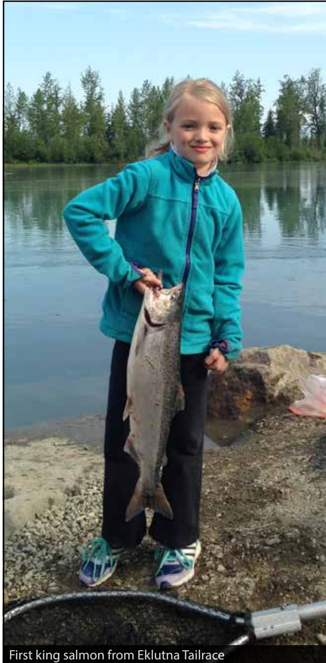
First king salmon from Eklutna Tailrace