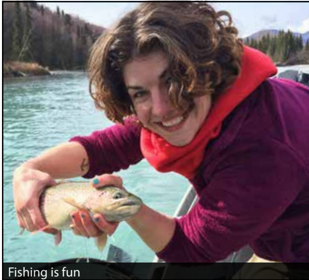
Fishing is fun