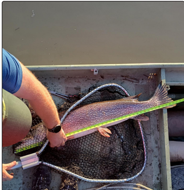
41-inch Northern pike from the Yukon River.