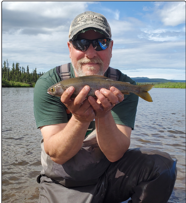
Arctic grayling from Beaver Creek.