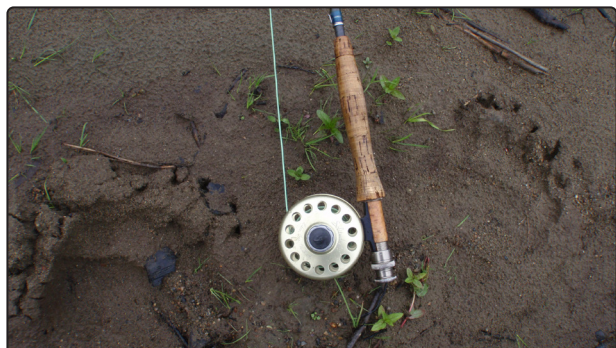
Remember to be safe and mindful while fishing.