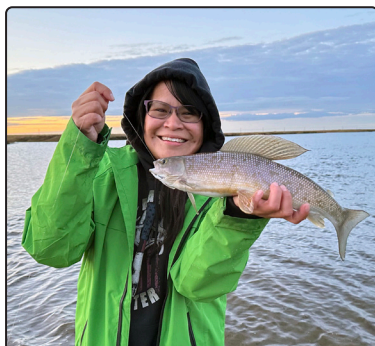
North Slope Arctic grayling.