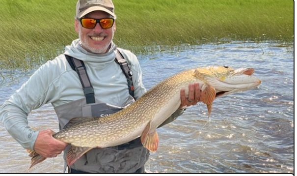
47-inch Northern pike from Holitna River.