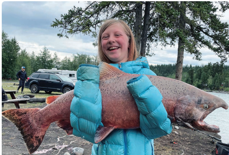
A smile as big as her catch.