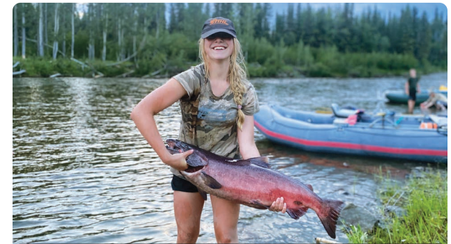
A king salmon caught during a family floating trip.