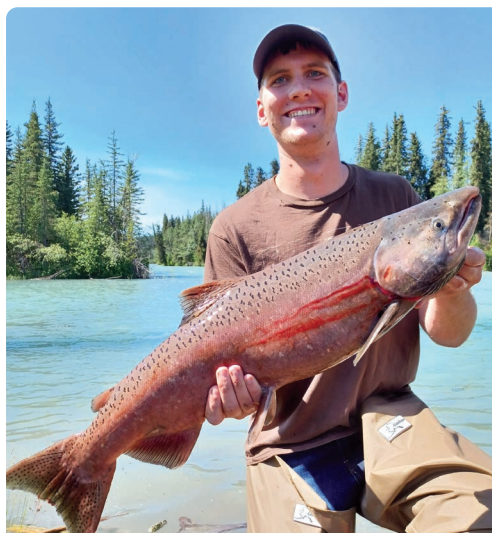
Summer memories made.

GET THE LATEST FISHING INFO EMAILED TO YOU. SIGN UP ONLINE AT WWW.WEFISHAK.ALASKA.GOV