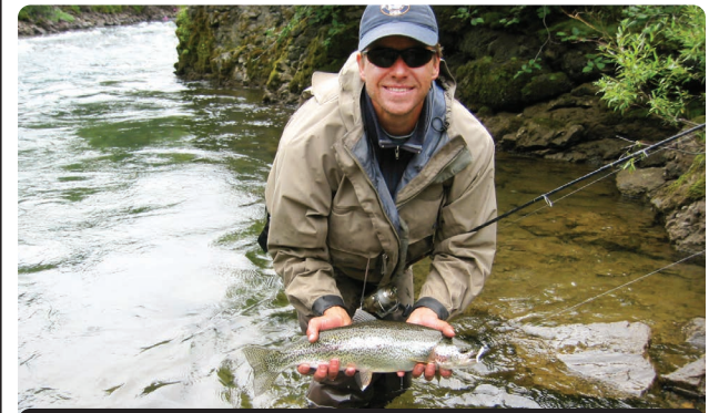
A successful fishing trip on the Aniak River.