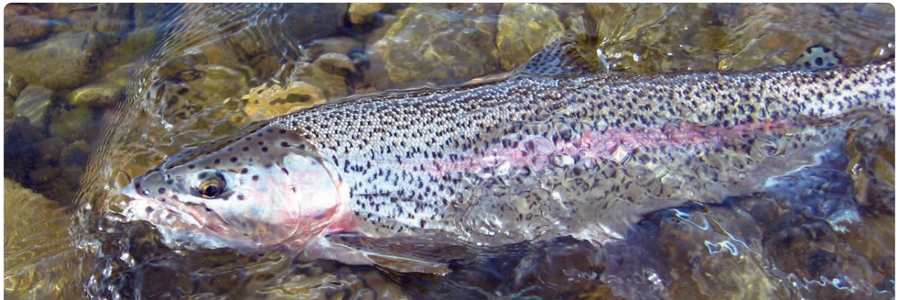
Rainbow trout caught in the Aniak River.