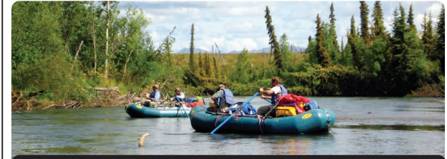
Floating the Aniak River.