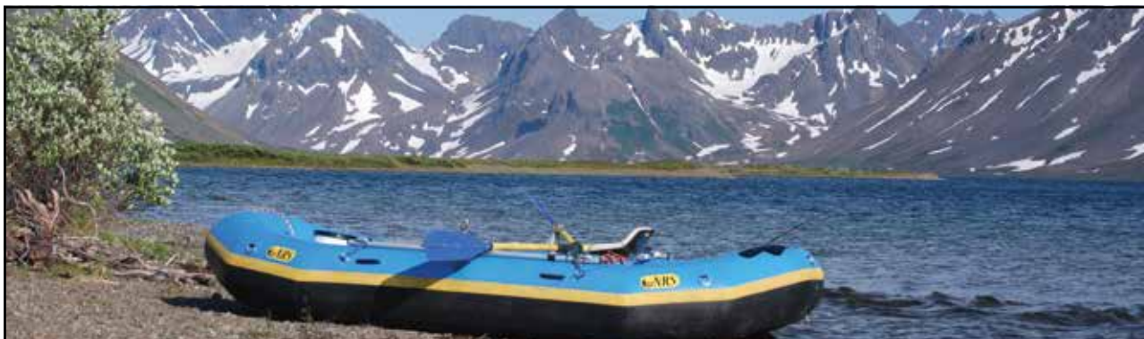
Raft near the outlet of Kisaralik Lake.

Fishing Reports ↪ Advisory Announcements ↪ Emergency Orders