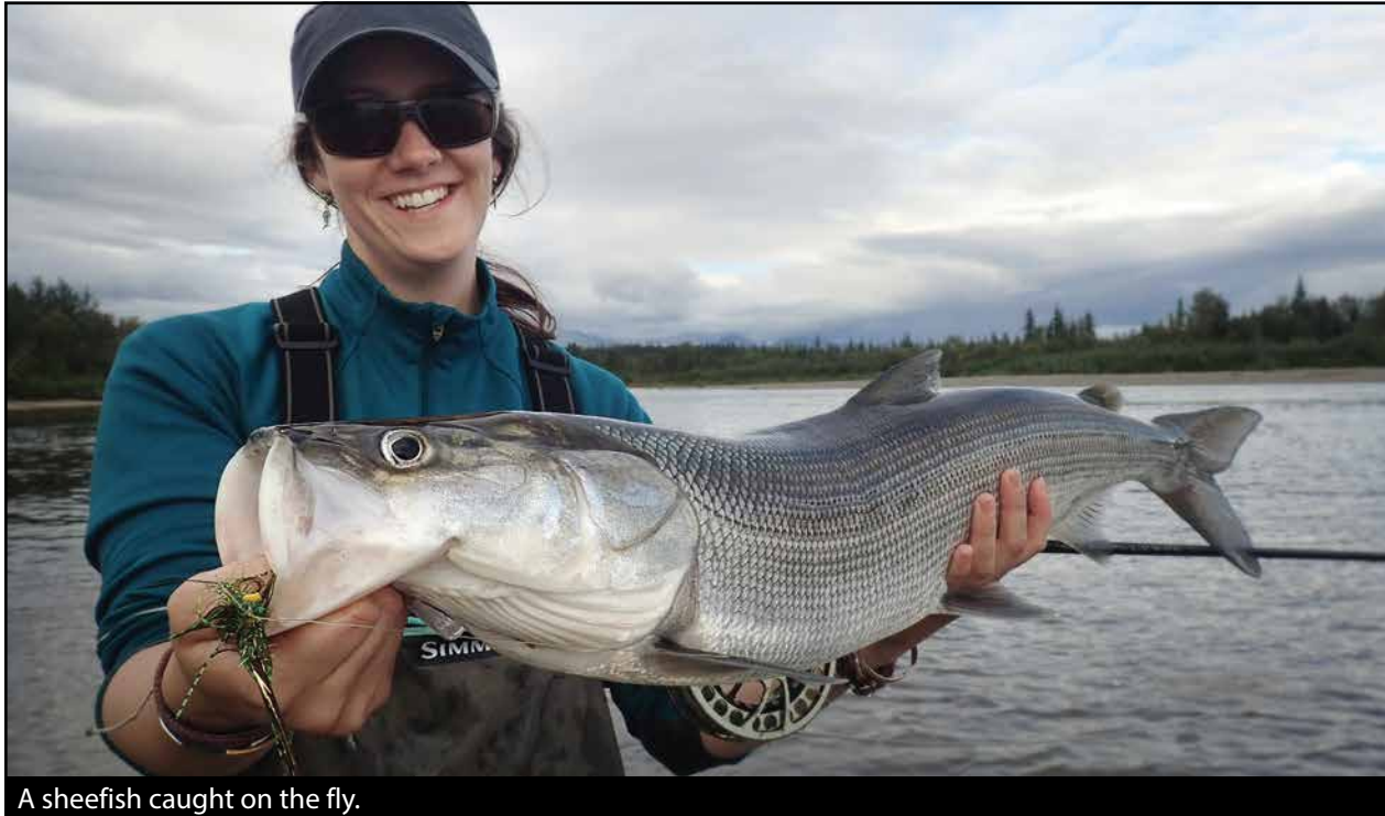
A sheefish caught on the fly.