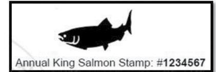
This is an example of a king salmon stamp purchased online.

Anglers sport fishing for king salmon (except king salmon stocked in landlocked lakes) must purchase a current year's king salmon stamp. Stamps purchased online can be printed immediately. If you purchase a physical stamp, it must be signed across the face of the stamp, in ink, and stuck to the back of your sport fishing license.