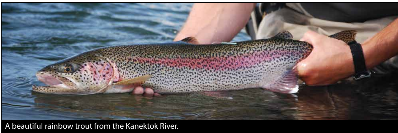
A beautiful rainbow trout from the Kanektok River.

Fishing Reports ↗ News Releases ↗ Emergency Orders