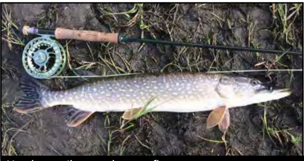
Northern pike caught on a fly

The intentional waste or destruction of any species of sport-caught fish is prohibited.