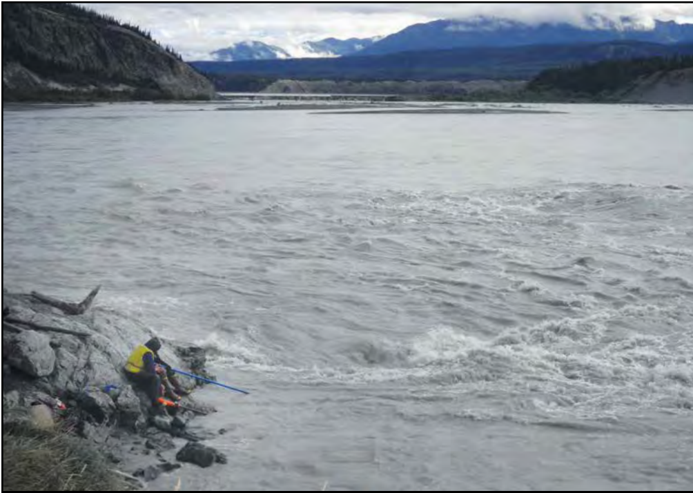
Dipping the Copper River