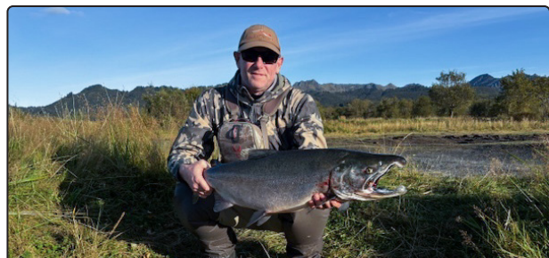
Walter Bird, coho salmon, Olds River

Questions? Please contact the Kodiak area office at (907) 486-1880.