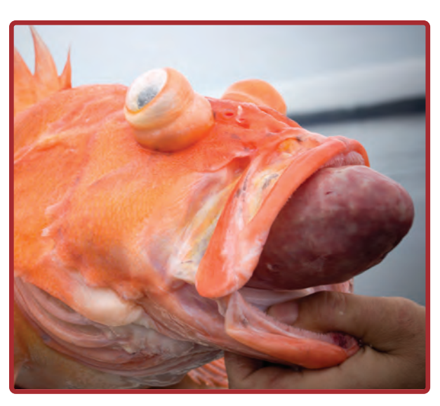
LEARN MORE AT WWW.ADFG.ALASKA.GOV/ROCKFISH

Rockfish caught in deep water often sustain injuries - referred to as barotrauma - caused by rapid decompression and expansion of gases in the swim bladder.