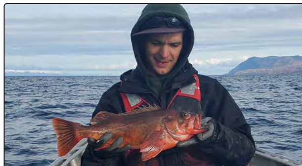
Northern rockfish from Kodiak Island saltwaters.