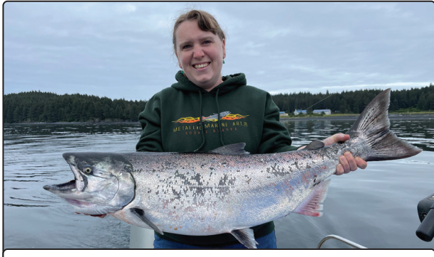
Woody Island Chinook salmon.