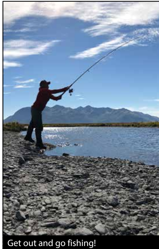
Get out and go fishing!