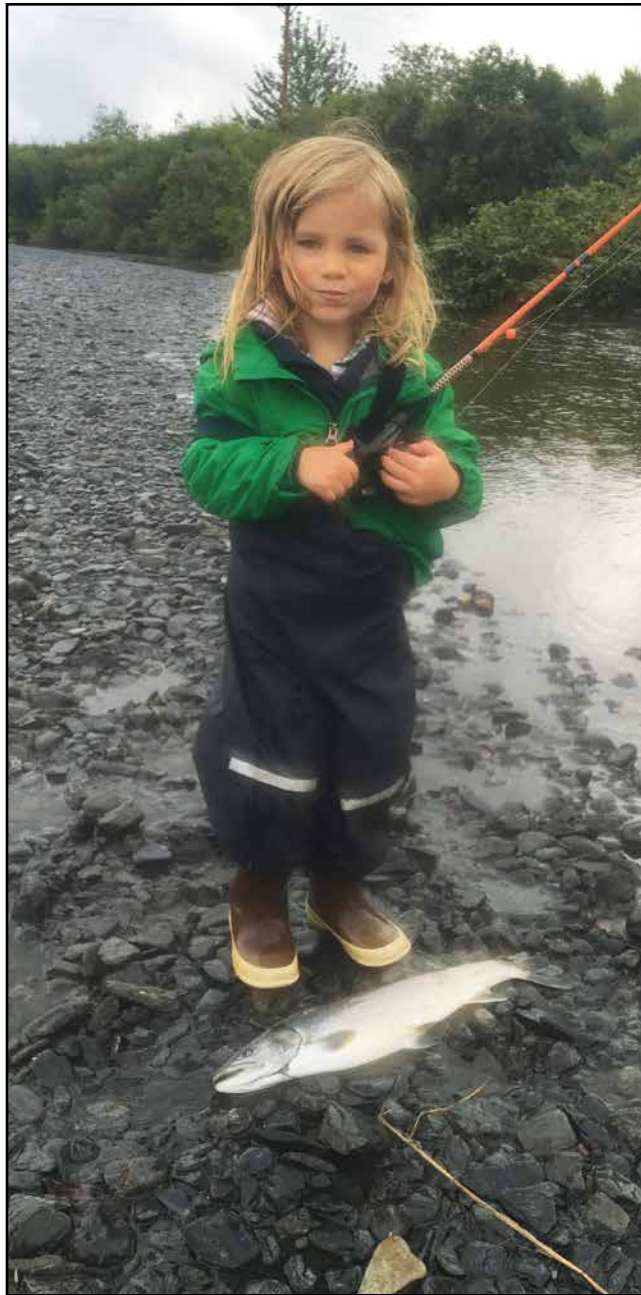
Dolly Varden from the American River