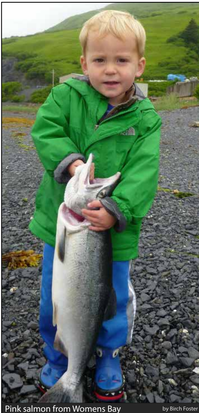
Pink salmon from Womens Bay