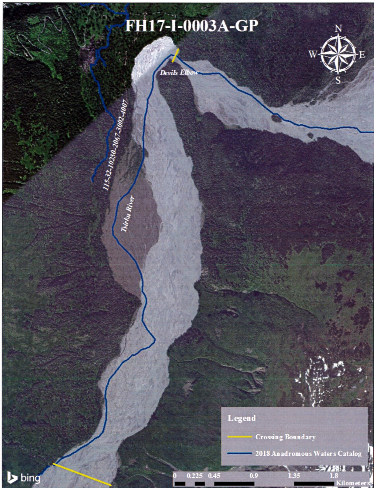
Figure 1.—Tsirku River crossings approved between yellow lines.