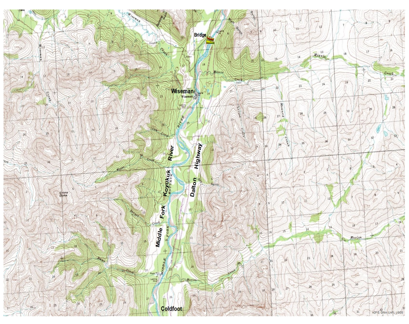
Map 1 of 3 Middle Fork Koyukuk River – Dalton Hwy